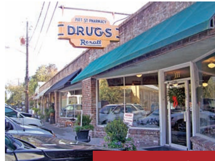
Pitt Street Drugs (above) and The Village Bakery (below) are located in the Old Village, Mount Pleasant's original town center.

Another major shopping center on Coleman is the Moultrie Plaza , across the street from Moultrie Middle School, where you'll find a fitness center, an antiques and crafts mall, a variety of smaller boutiques and a restaurant or two. Just down the road, a new breed of boutique is cropping up: live/work developments.